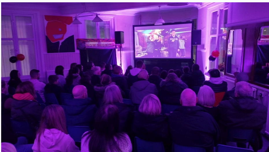
Premiere of Dead Funny

The project brought in outside expertise and training to upskill individuals in scriptwriting, filming and editing. The scriptwriting was delivered by a published author and worked in partnership with Baby Grand Productions to train participants in detailed aspects of film, directing, acting and editing.